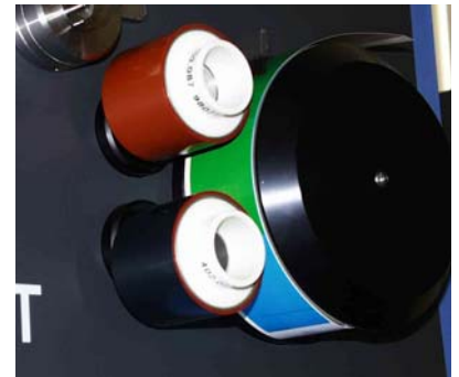
Fig. 2: wet-on-wet printing on GST2