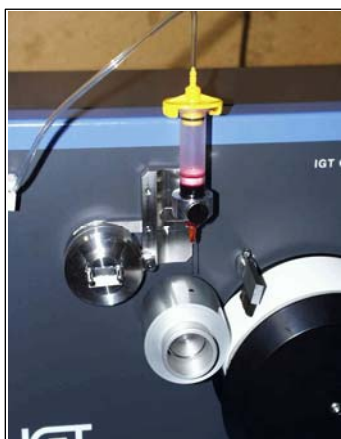
Fig. 2: Print penetration set GST1