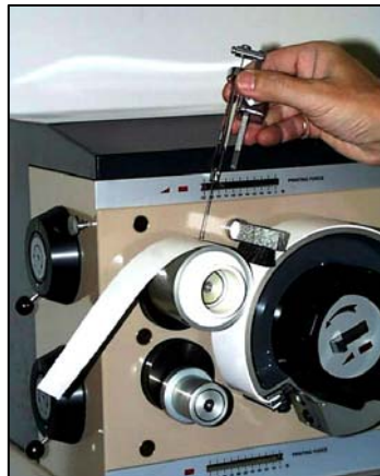
Fig.1: Roughness on AIC2-5T2000