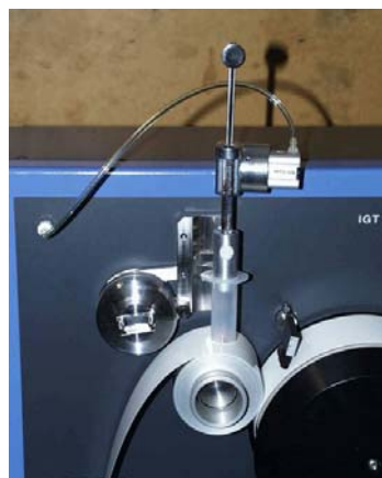
Fig.2: Roughness on GST 1/1W