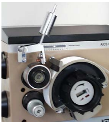
Fig. 1: Heliotest accessory AIC2-5T2000