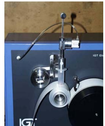
Fig. 1: Roughness set on