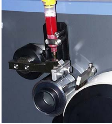
Fig. 2: Gravure accessory of GST