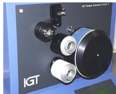
Fig. 1: Absorption of rubber blanket with Global Standard Tester 2