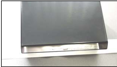
Fig. 3: Pick start viewer