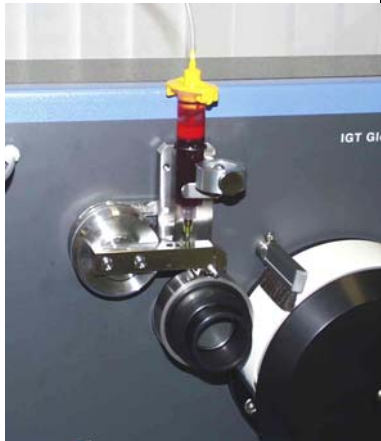
Fig. 1: Westvaco system on GST1-W