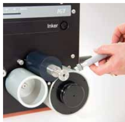
Applying ink with the IGT ink pipette