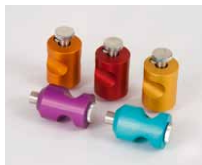
The IGT fixed volume ink pipettes