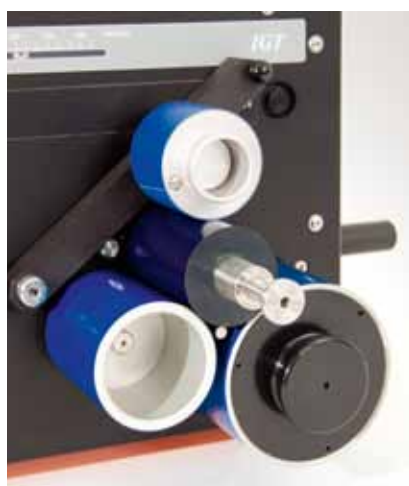
Inking the printing disc

Printing force is applied using push-buttons on the front of the instrument. With the Orange Proofer 70 it is possible to use printing discs with different width. The device is especially designed to print directly on e.g. credit cards or on substrates used for abrasion tests with a maximum print width of 70 mm. If there is a regular need for a wider print the best choice is the Orange Proofer 70.