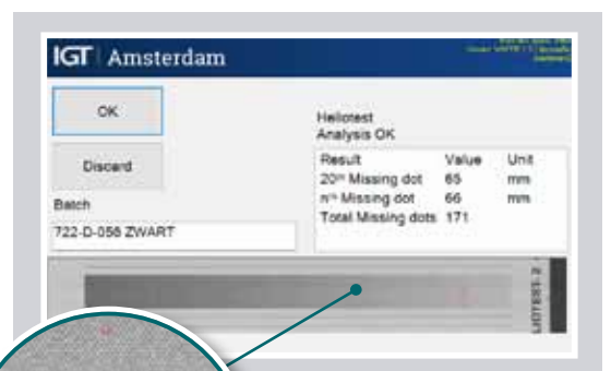
HelioTest: the test result