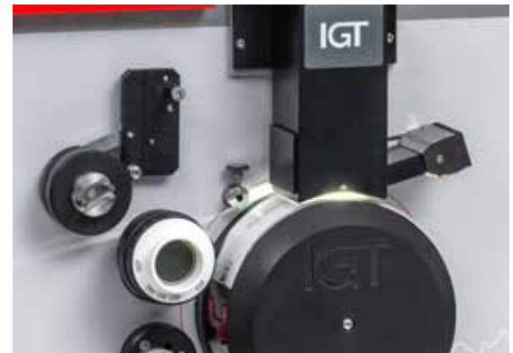
IGT Pick ISO 3783: the camera is scanning

Our software engineers will continue to develop new analysers, and these will then be announced on the website.