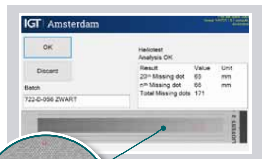
Heliotest: the test result