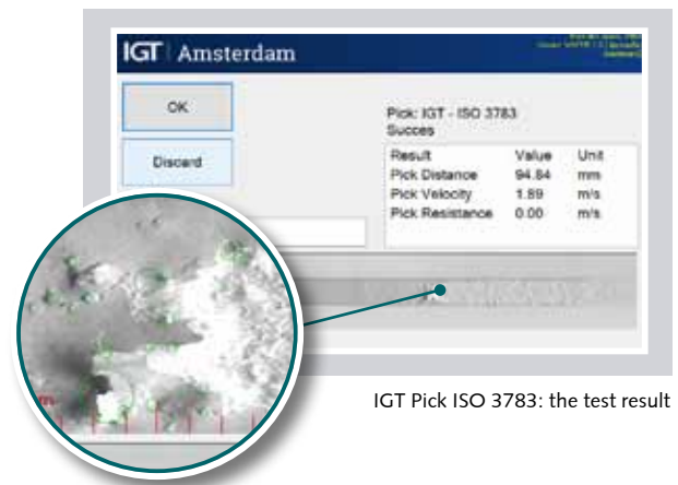
IGT Pick ISO 3783: the test result

Until now algorithms have been developed for the following test methods: Pick – Heliotest – Mottle – Print penetration - IGT Roughness – Hydro-expansivity. An actual overview can be found on the IGT website.