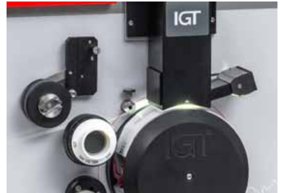
IGT Pick ISO 3783: the camera is scanning

Our software engineers will continue to develop new analysers, and these will then be announced on the website.