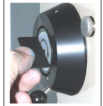
Fig. 1: special key for back lash