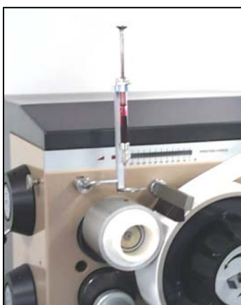
Fig. 1: Print penetration set AIC2-5T2000

Between the printing disc and a paper strip of the sector of an IGT-printability tester a drop of oil with a volume of 5.8 \pm 0.3 mg is spread to a stain (see figure 2). The length of the stain is measured. The stain length is increasing when the roughness and/or absorption of the paper is decreasing.