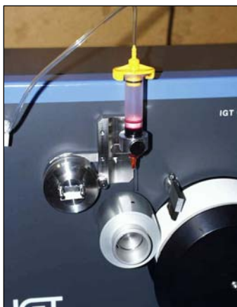
Fig. 2: Print penetration set GST1