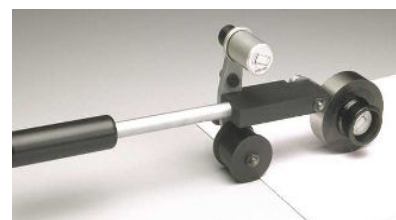
Fig. 1: disc holder on paper