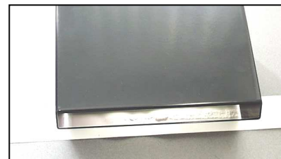
Fig.1 IGT Pick Start Viewer PSV