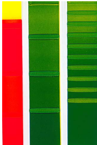
Fig. 2: wet-in-wet prints with 2, 4 and 10 fields