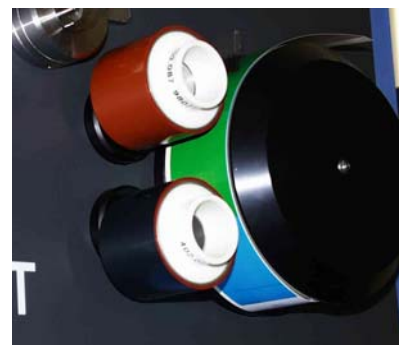
Fig. 2: wet-on-wet printing on GST2