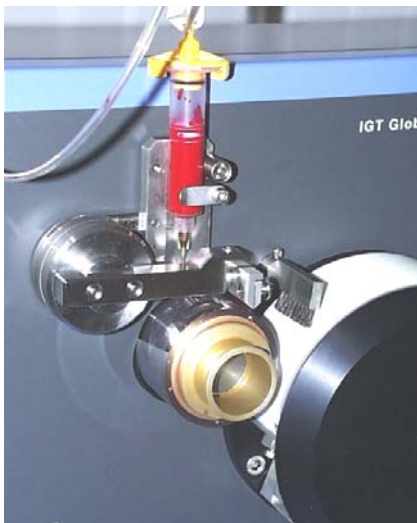
Fig. 1: Gravure accessory