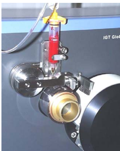
Fig. 1: Gravure accessory